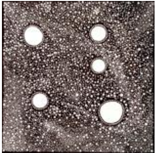
Southern Cross Wedge Tail Eagle Chick Coming Out of Nest. By Vincent Forrester-Mutitjulu

http://www.northsydneycatholics.com/resources/liturgy/154-ministries/environment-group/701-australia-day-prayers